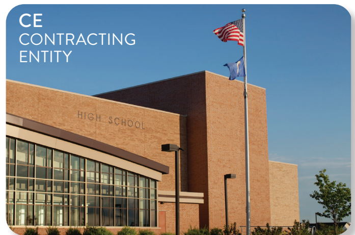
CE CONTRACTING ENTITY