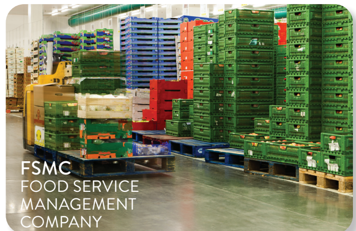
FSMC FOOD SERVICE MANAGEMENT COMPANY