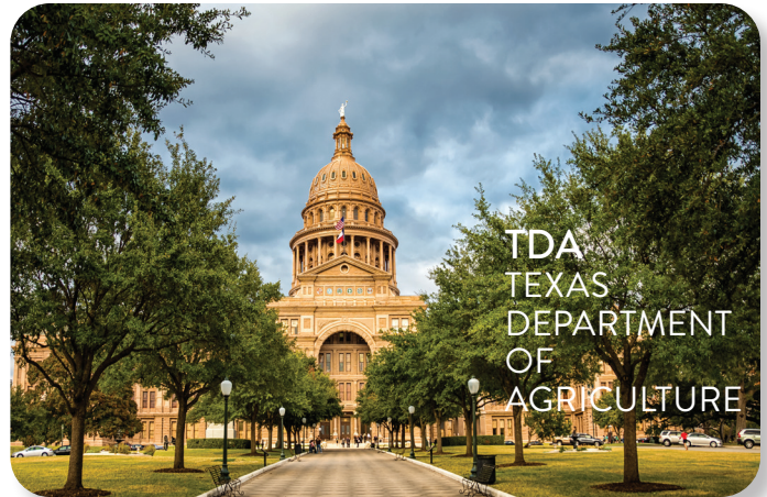
TDA TEXAS DEPARTMENT OF AGRICULTURE