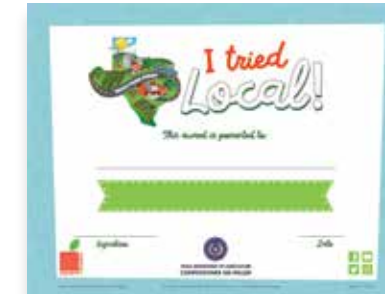
Editable Award Certificate