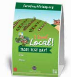
Table Tent Announcement