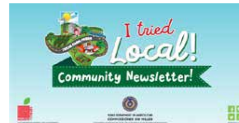
Email Header Graphic